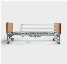
Verso HC Collapsible side rail in steel.