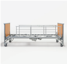
Scala 2 Side rail in steel.