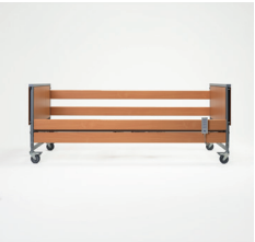
Slim Full length side rail in Pine wood.