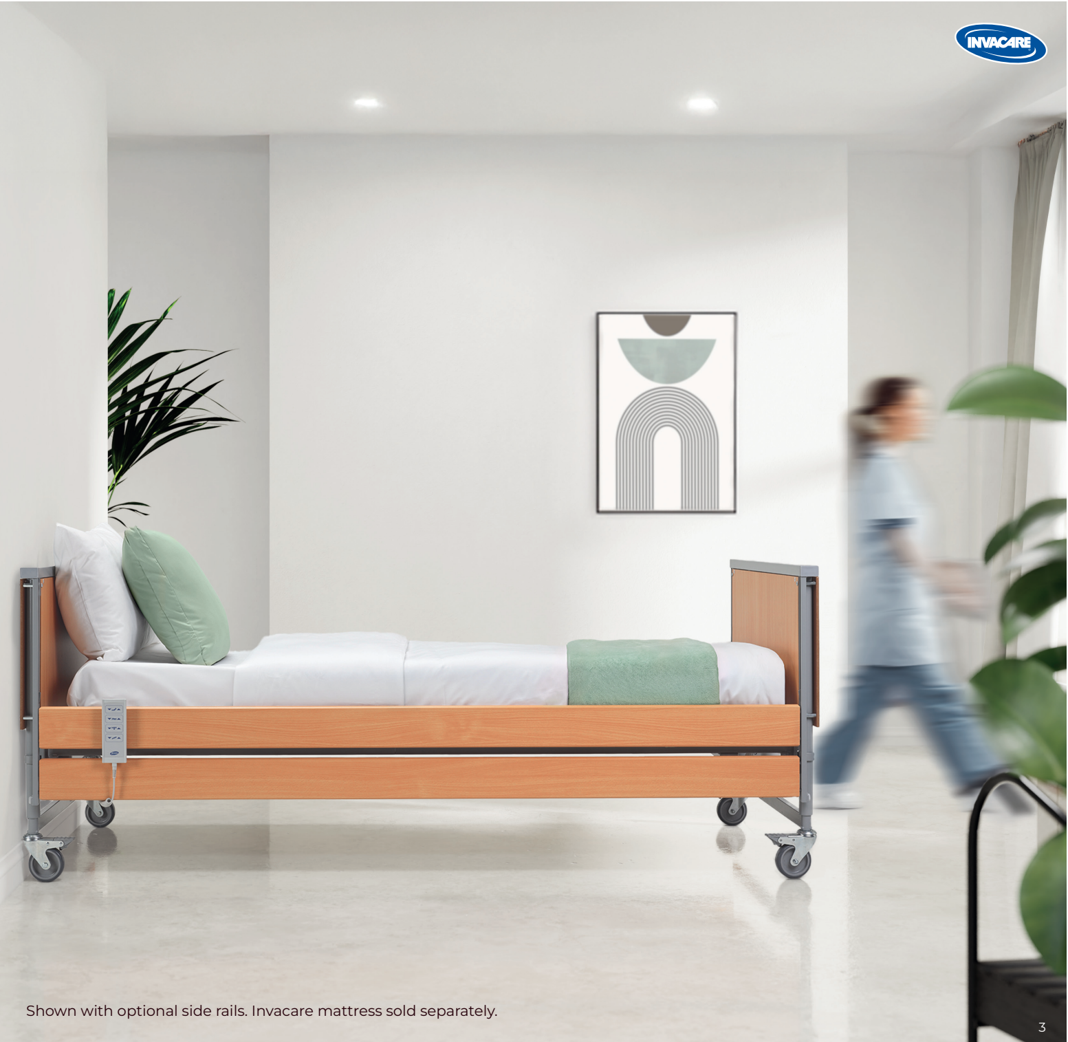
Shown with optional side rails. Invacare mattress sold separately.

Accent is an easy and user-friendly choice for patients, families and caregivers.