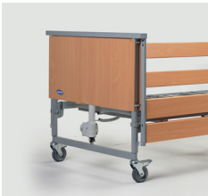
Bed end Optional panel.