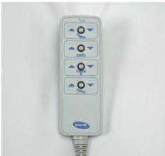
Alternative handset With lockable tilt for peace of mind.