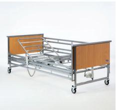
Aria Full length side rail in steel.